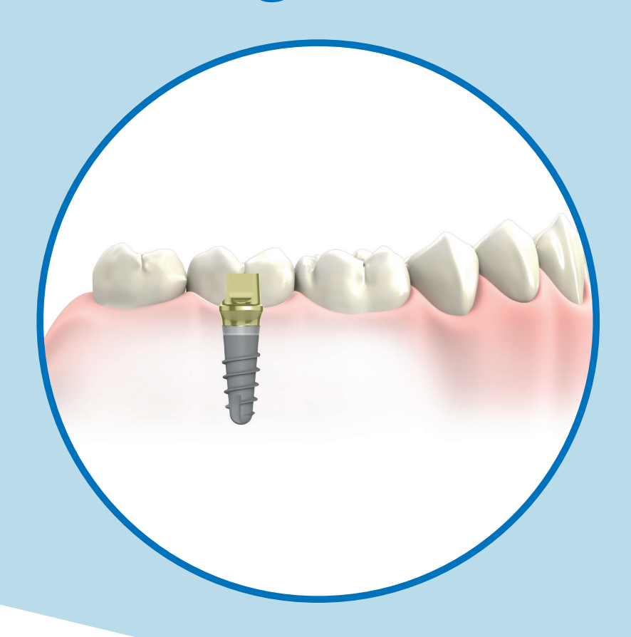
More than one tooth